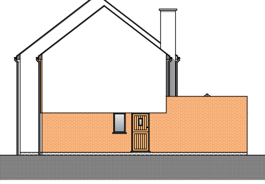
Side Elevation to no.10 1:100