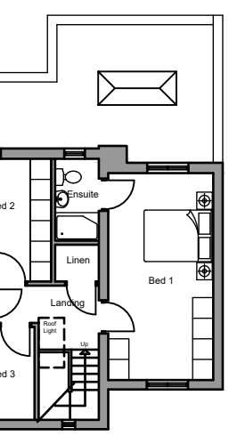
First Floor Plan 1:100